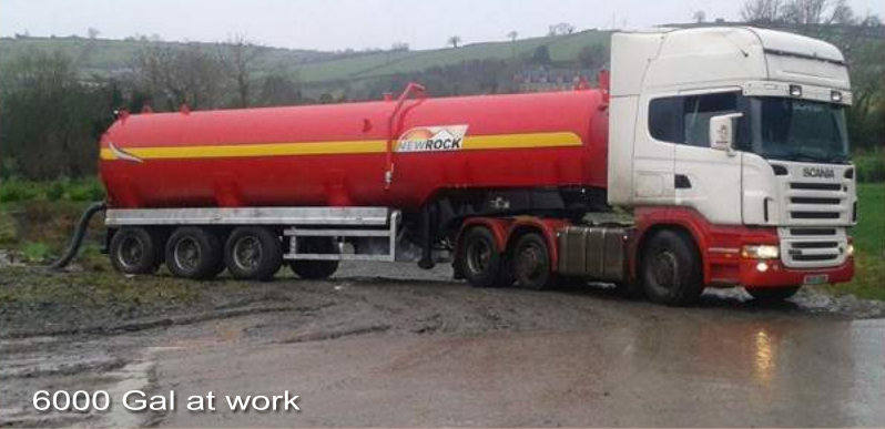
6000 Gal at work