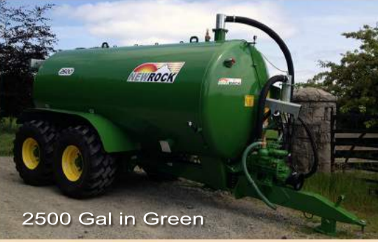
2500 Gal in Green