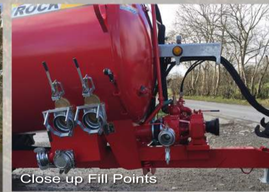
Close up Fill Points