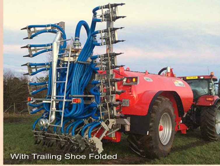
With Trailing Shoe Folded