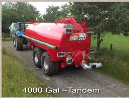
4000 Gal -Tandem