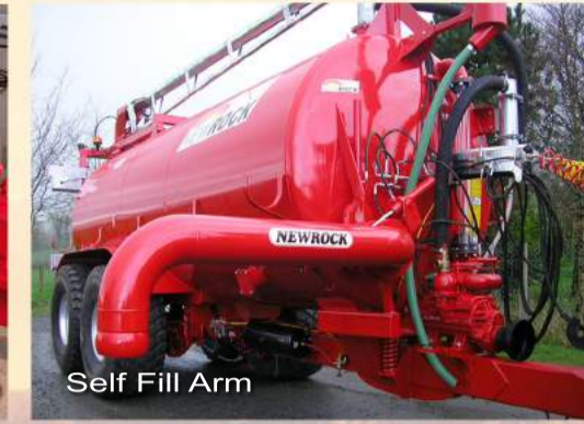
Self Fill Arm