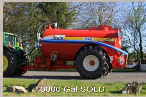
3000 Gal SOLD