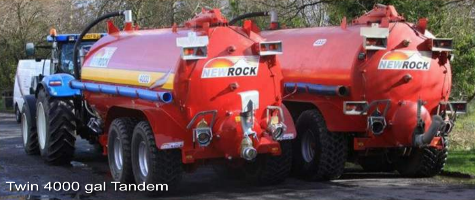
Twin 4000 gal Tandem