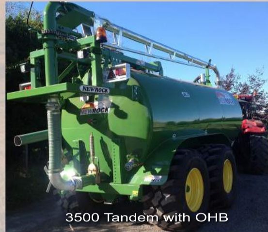
3500 Tandem with OHB