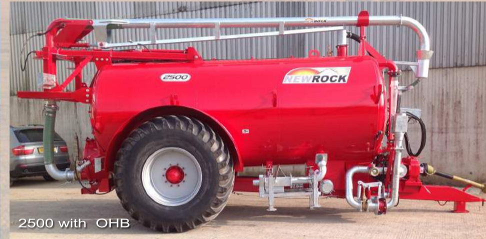
2500 with OHB