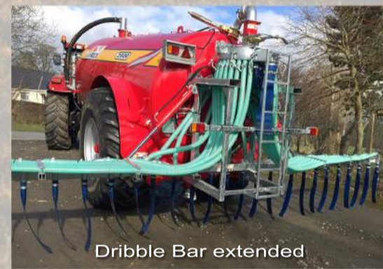
Dribble Bar extended