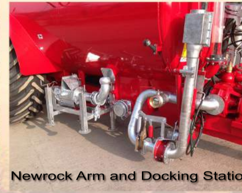
Newrock Arm and Docking Station