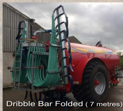
Dribble Bar Folded ( 7 metres)