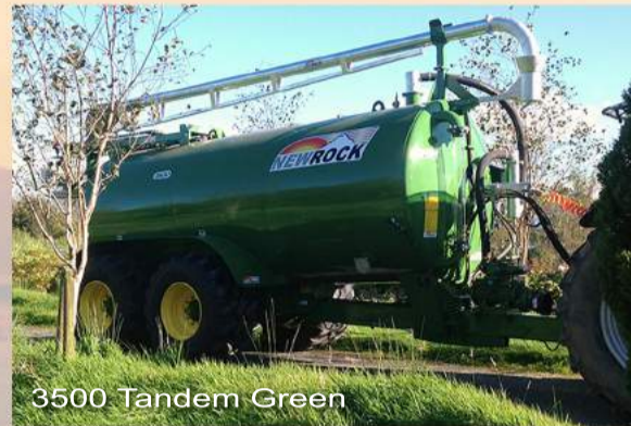
3500 Tandem Green