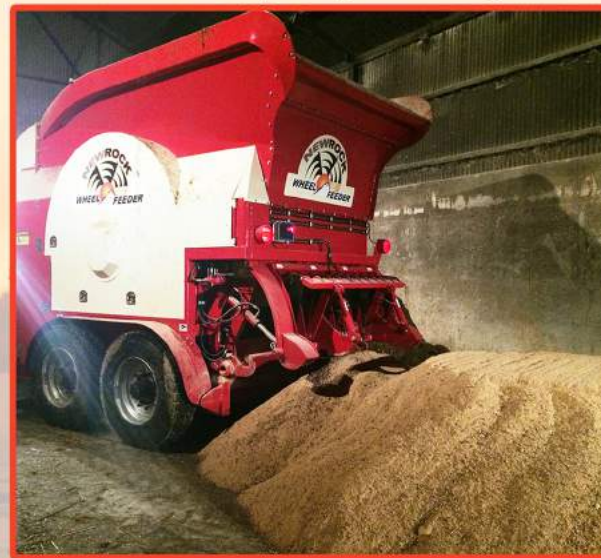
Discharging meal mix as you drive forward