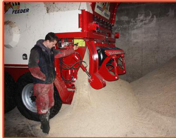
Bomb door opening to discharge