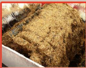
Cutting blades in operation Cutting the material